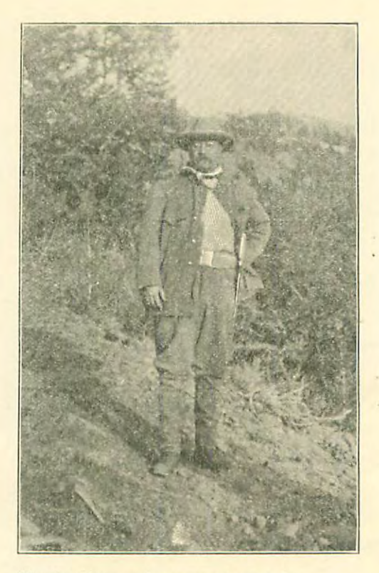
The President as he appeared when he returned from the canon.